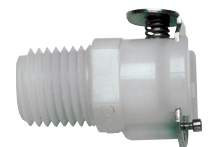
Typical shown: 1/4" NPT Male Pipe Thread with Shut-off Valve

These adapters are available with or without an integral shut-off valve. The shut-off valve will stop line flow when the adapter is removed from the unit. Flow resumes when connected.